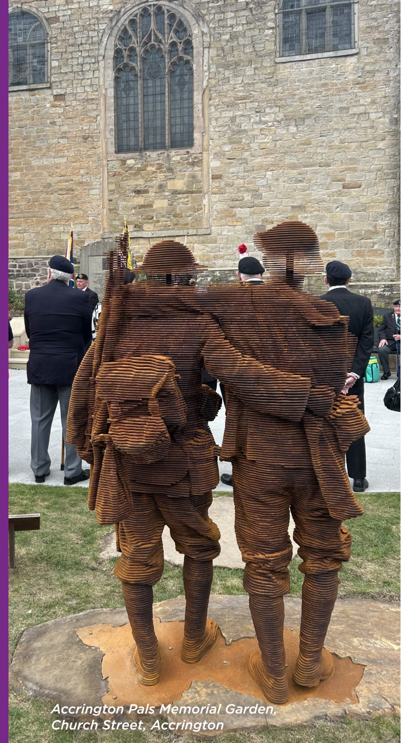
Accrington Pals Memorial Garden, Church Street, Accrington

We look forward to working together to deliver real, lasting improvements across the borough.