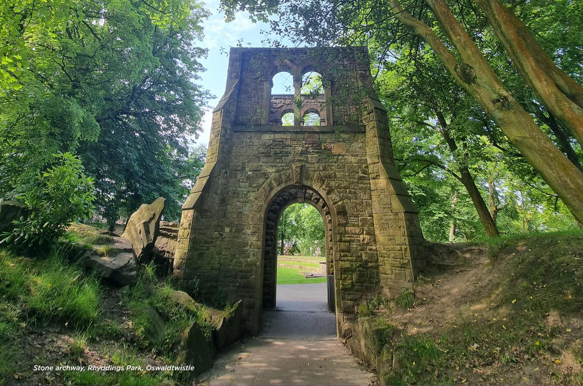
Stone archway, Rhyddings Park, Oswaldtwistle