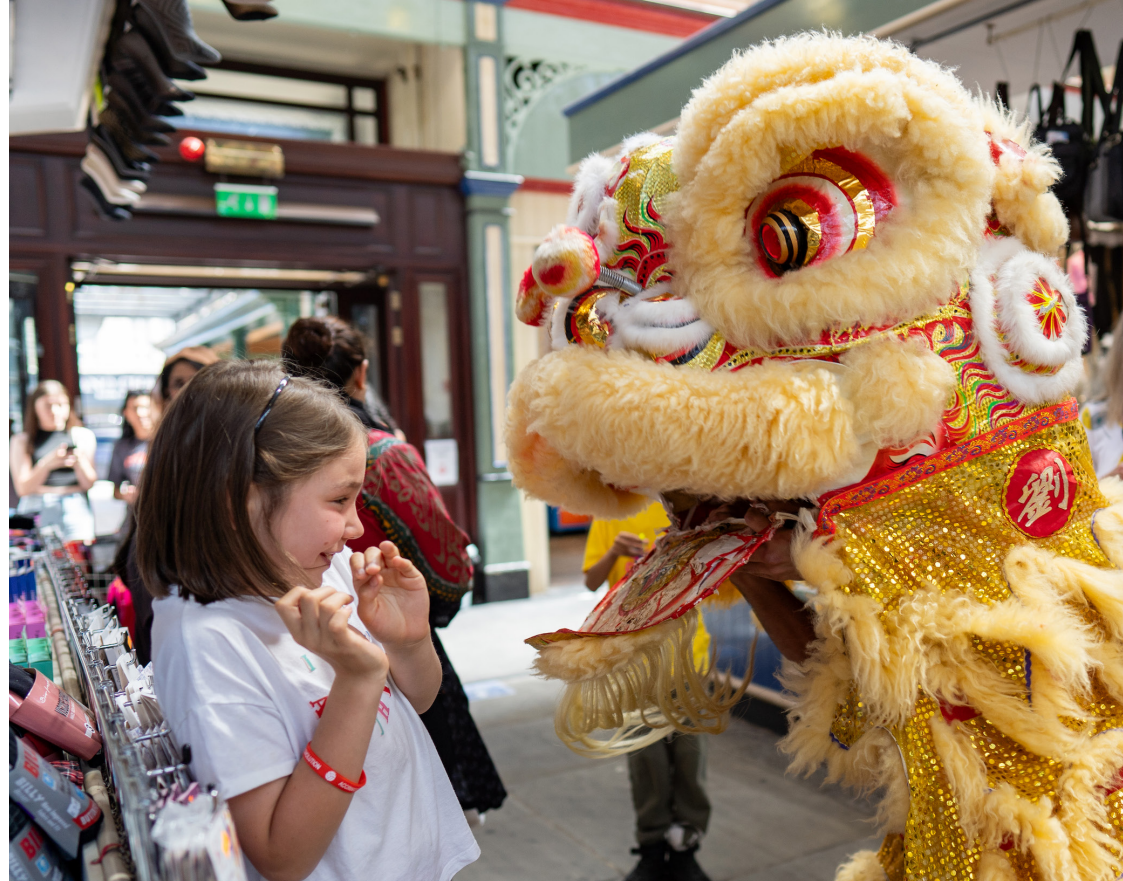
Connecting Cultures event 2023, Accrington Market Hall