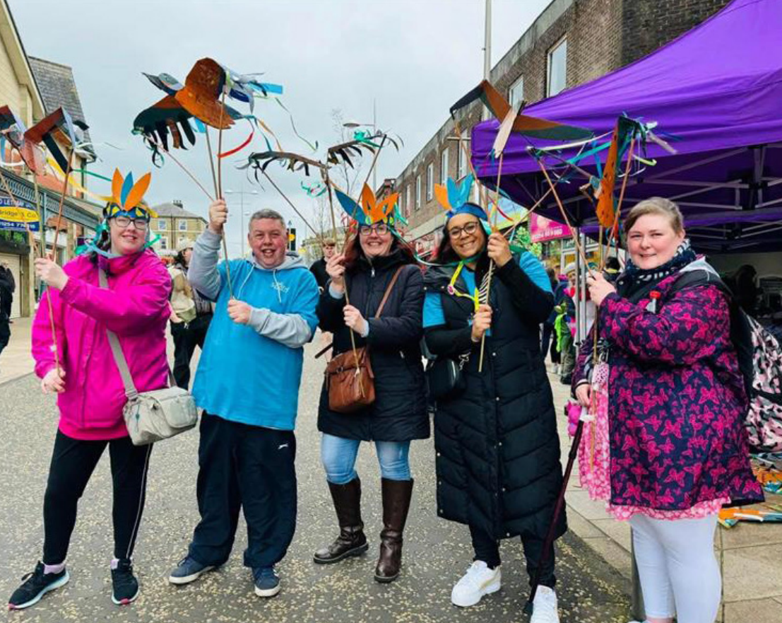
Local Learning Disability inclusion organisation Spring into Action