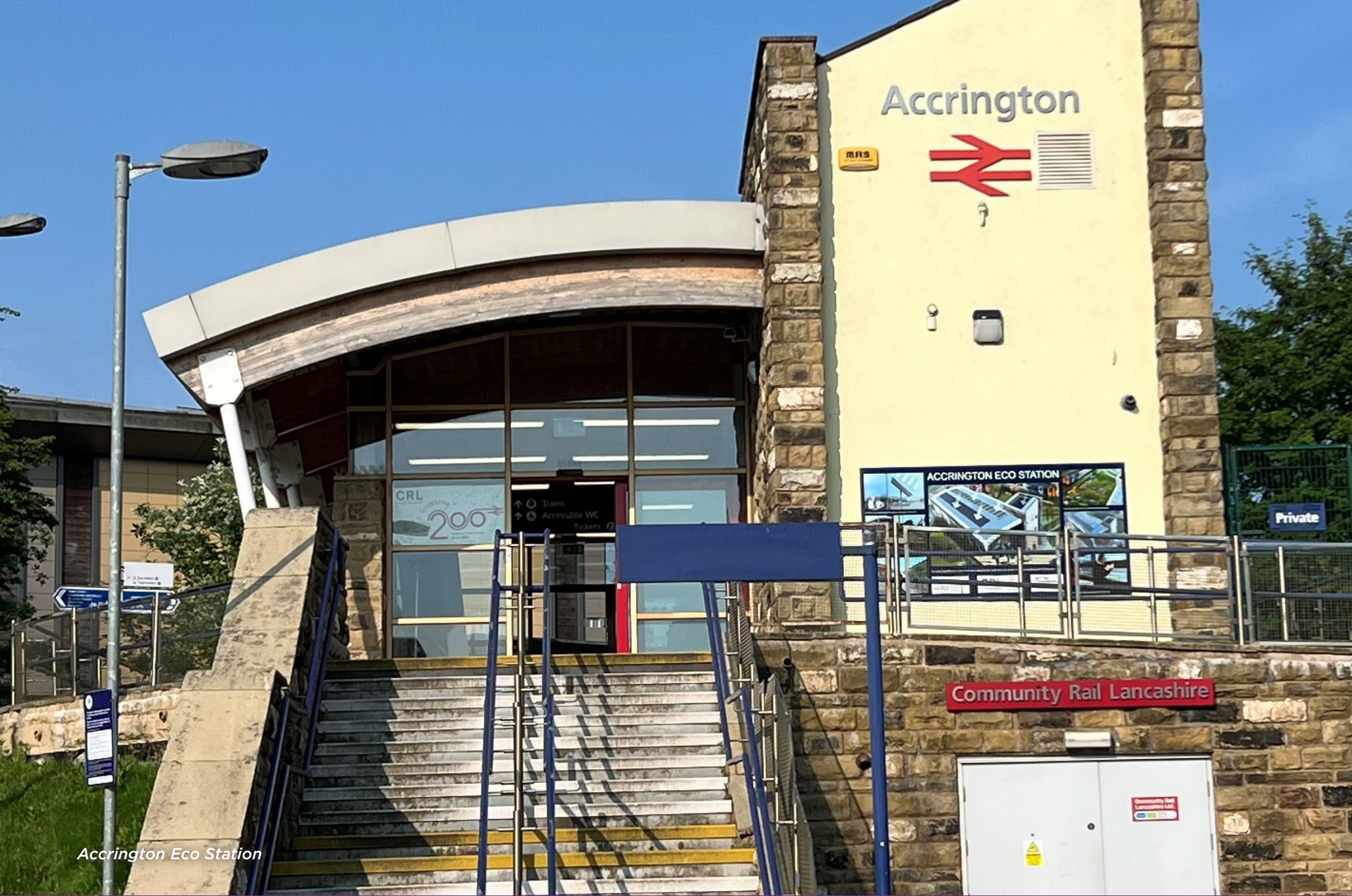
Accrington Eco Station