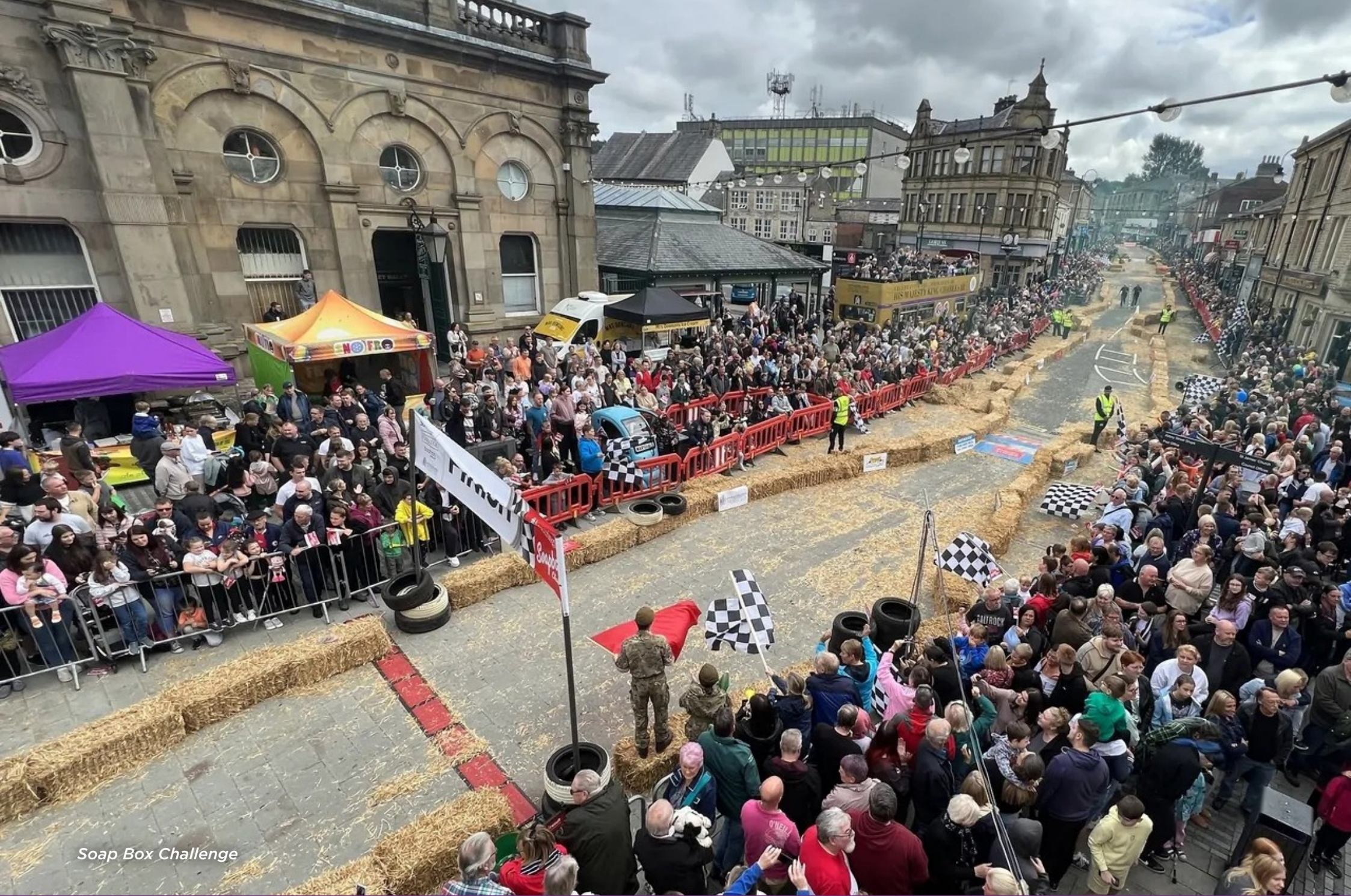
Soap Box Challenge