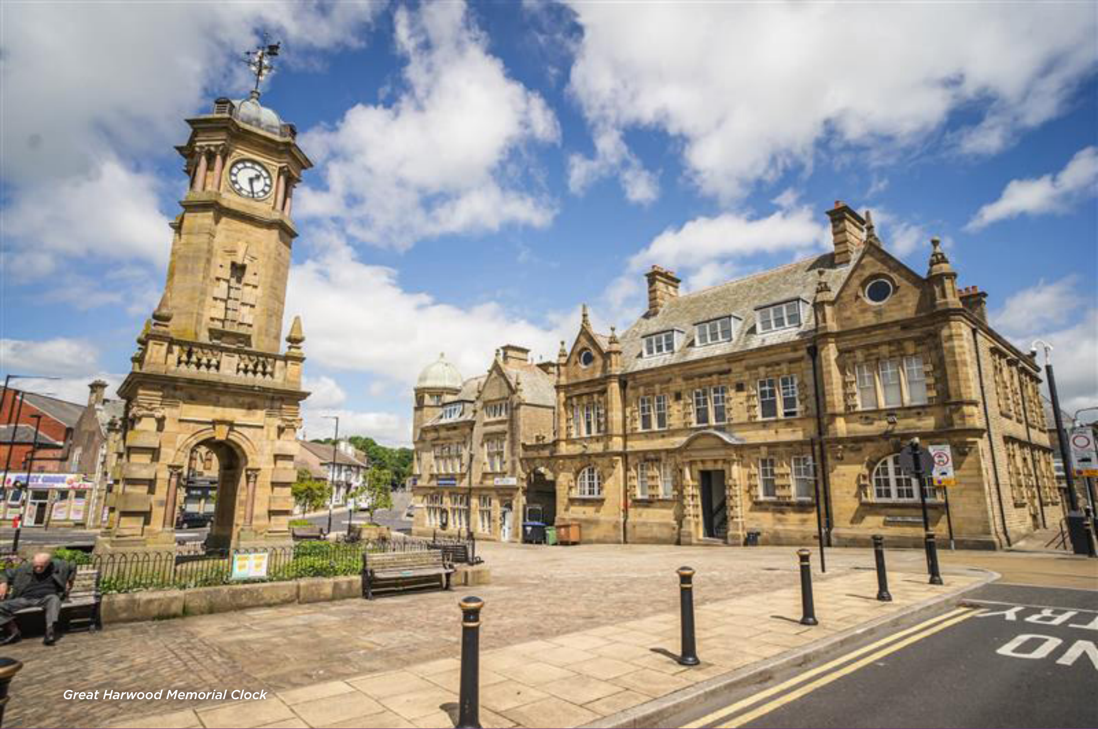
Great Harwood Memorial Clock