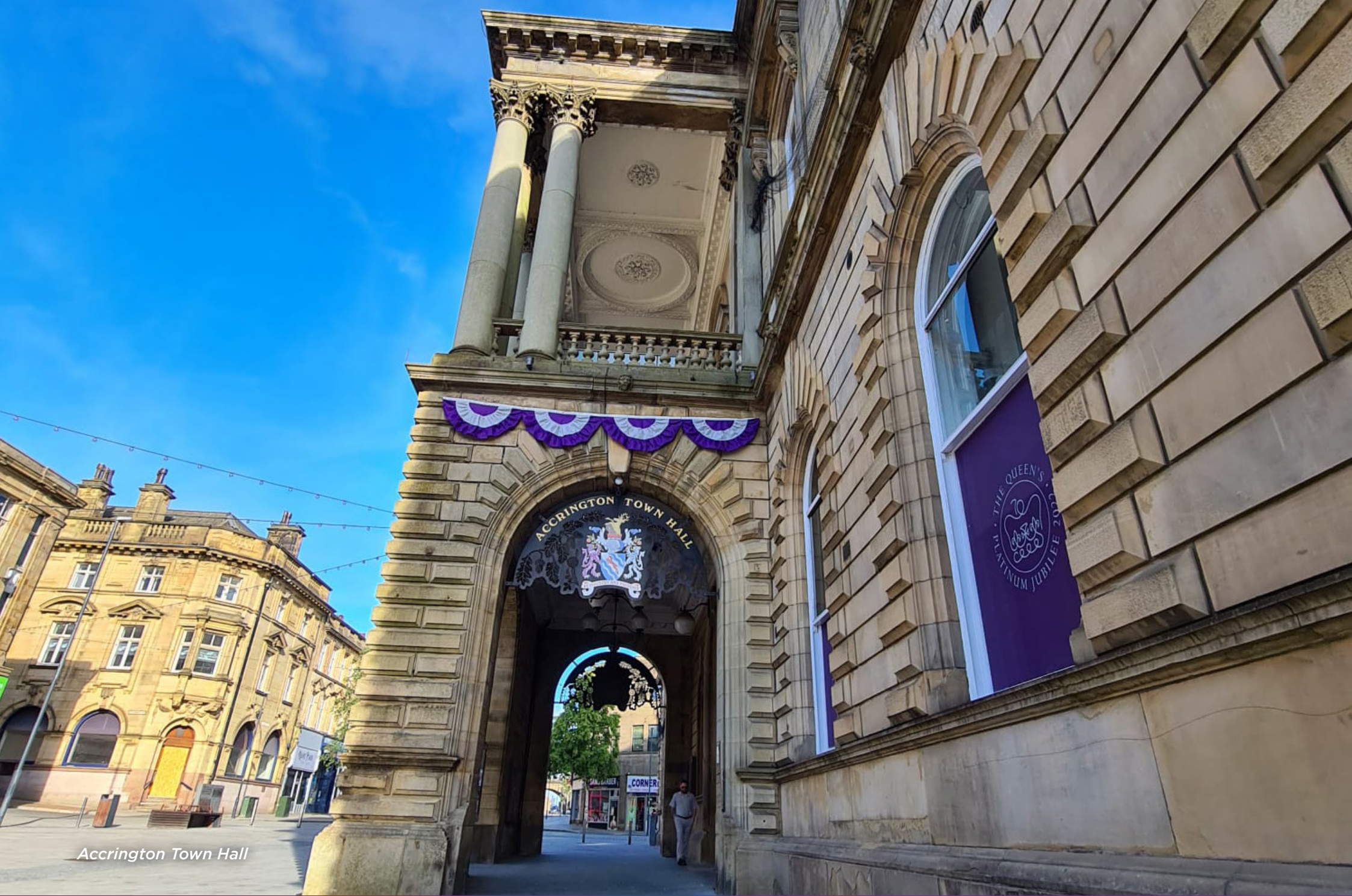
Accrington Town Hall