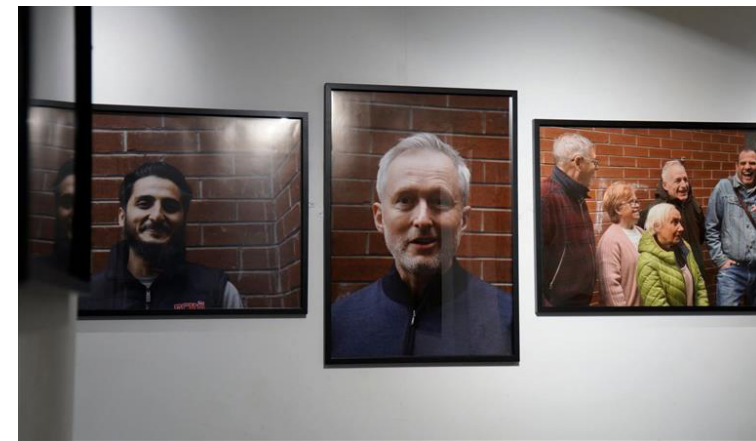
Picture Hyndburn exhibition